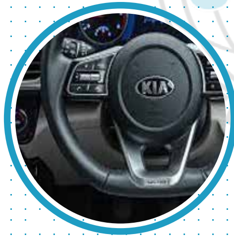
CAR STEERING CONTROL