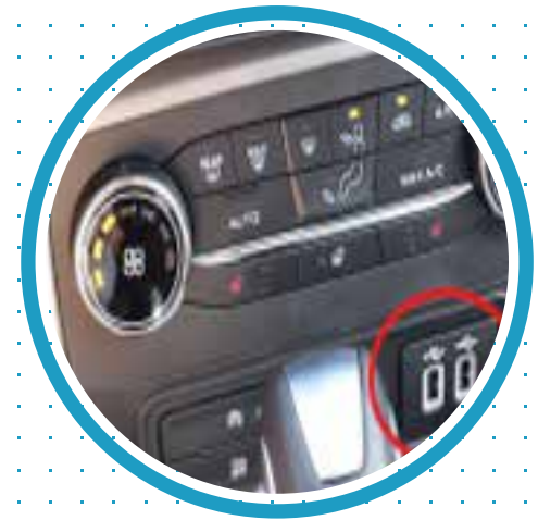
CAR USB CHARGER