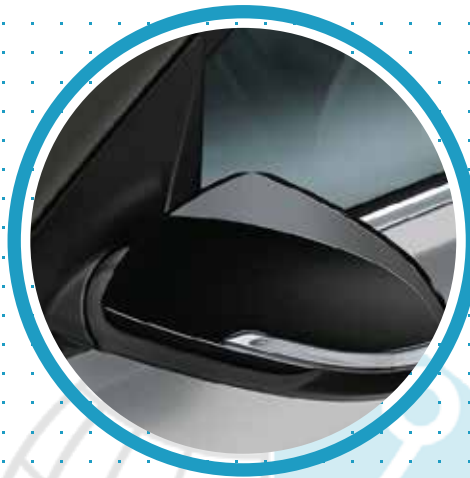
KIA SIDE MIRROR